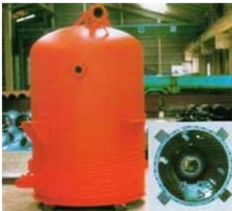
Polyethyleneinner lining for tank